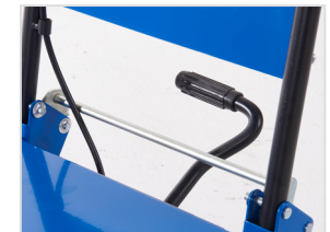
Pump action foot pedal