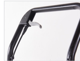
Slow release handle