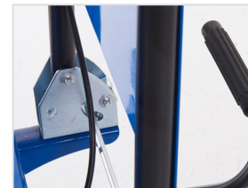
300 & 500kg close up