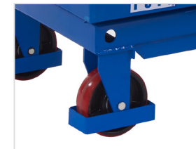
Front castors close up