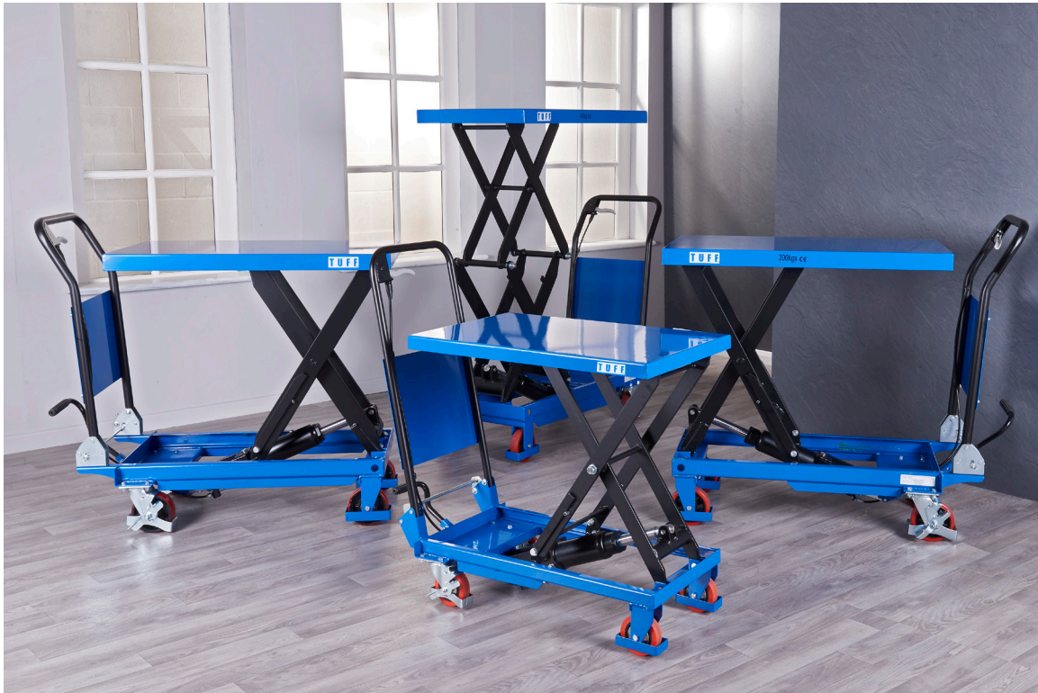
TUFF Scissor Lift Tables